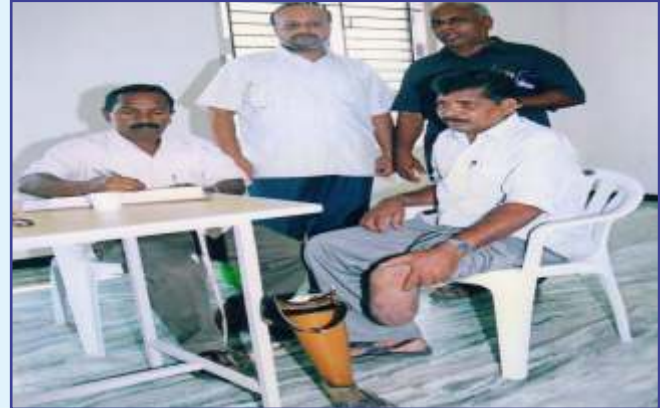
Help to Physically Handicapped