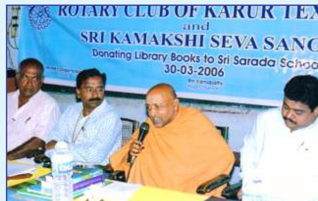
Donating Books to Village School