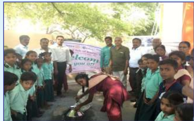
Water Facilities to Village Govt School