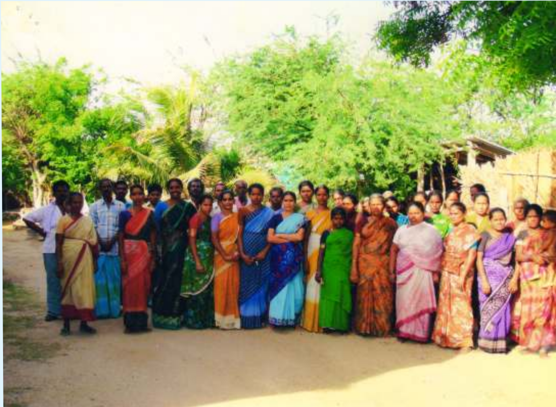
Micro Credit Self help Group Leaders