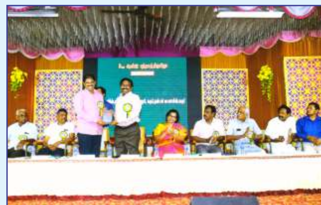
Sponsoring Book Fair